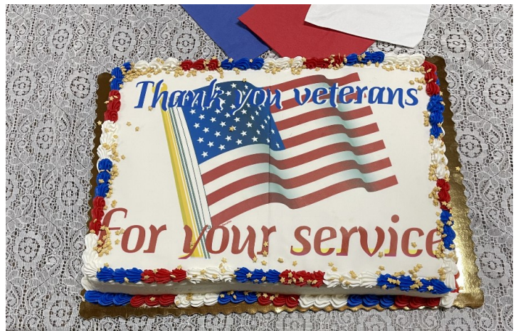
Celebrating Veteran's Day with a cake at Amazing Grace.