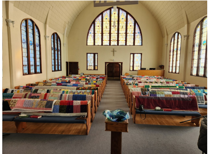
BLESSING of the QUILTS: These beautiful quilts are prayerfully made by the quilters ministry for local and global outreach.