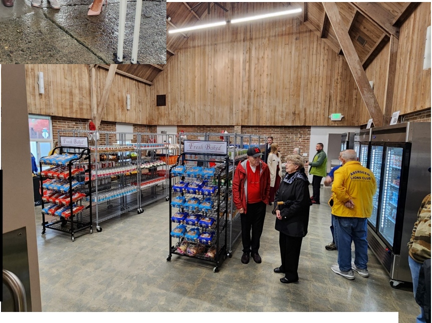
Inside the newly renovated Salvation Army food bank. It is a grocery store concept, where people in need can have choices and shop with dignity.