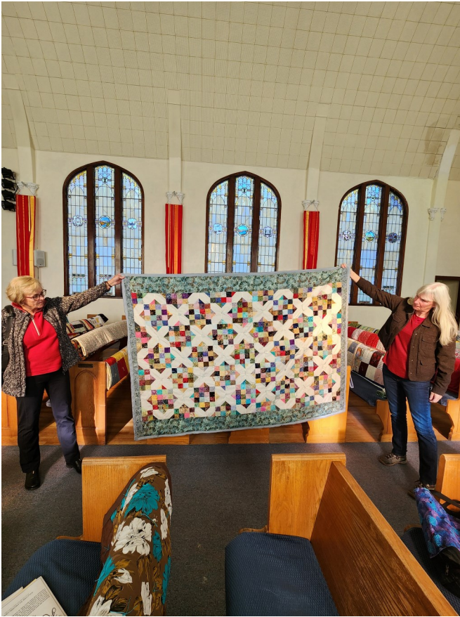
One of the many quilts blessed before shipping for outreach. Kristine Finazzo and Amy Ostwald hold up this gorgeous quilt for photo.