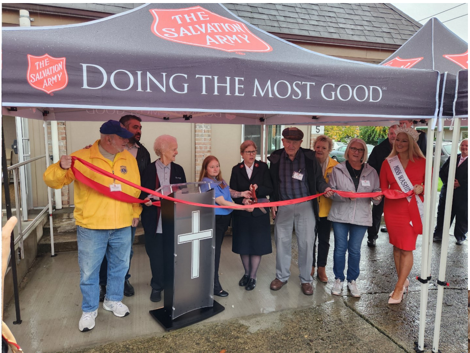
OUTREACH: OPEN HOUSE for the renovated Salvation Army food bank took place on November 6th in Aberdeen. AG volunteers, who are active at the Salvation Army foodbank, participated in the OPEN HOUSE.